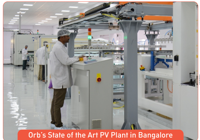
Orb's State of the Art PV Plant in Bangalore

Call us: + 91 9900520505 Email: sales@orbenergy.com Web: www.orbenergy.com